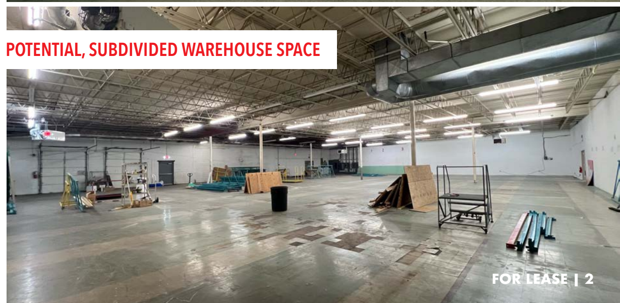
POTENTIAL, SUBDIVIDED WAREHOUSE SPACE