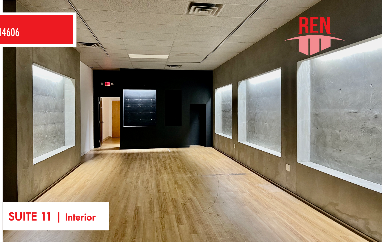
SUITE 11 | Interior